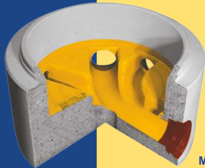
MADE OF POLYPROPYLENE