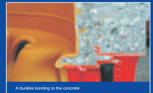
A durable bonding to the concrete