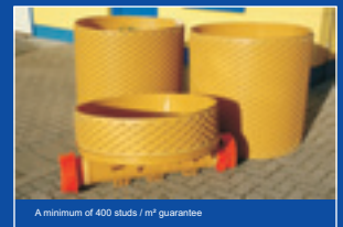
A minimum of 400 studs / m 2 guarantee